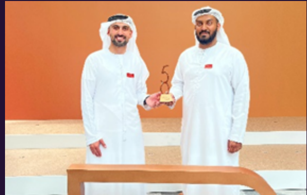
CHOSEN AMONG THE FUTURE 50 EMIRATI COMPANIES