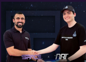
ADVANCED ROCKET TECHNOLOGIES (ART), UK