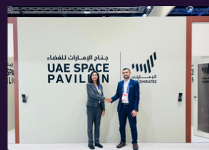
RAISE ME & SPACEKIDZ INDIA