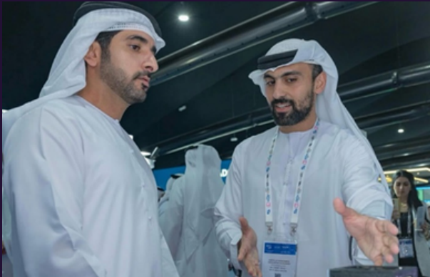
MEETING H.H. SHEIKH HAMDAN BIN MOHAMMED BIN RASHID AL MAKTOUM