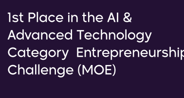
1st Place in the AI & Advanced Technology Category Entrepreneurship Challenge (MOE)