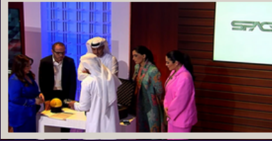
Shark Tank Dubai