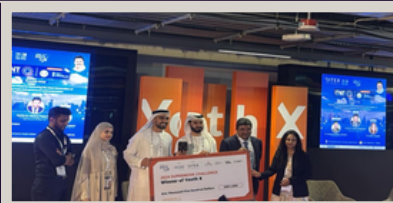
Won the Emiratipreneur Supernova Pitch Competition at Gitex Expand North Star (Among 50 Emirati Startups)