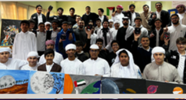
Knowledge Partner of Space42's Thuraya 4 Launch Campaign