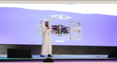
SEA SpaceTech Incubator (Saudi Arabia) (Alongside 20 Global Companies)