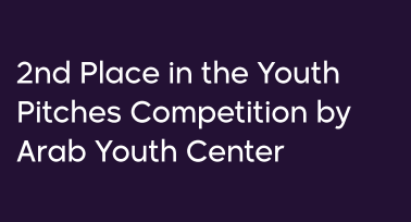
2nd Place in the Youth Pitches Competition by Arab Youth Center