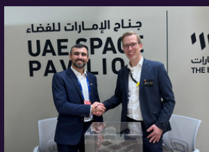
QUANTUM GALACTICS, GERMANY